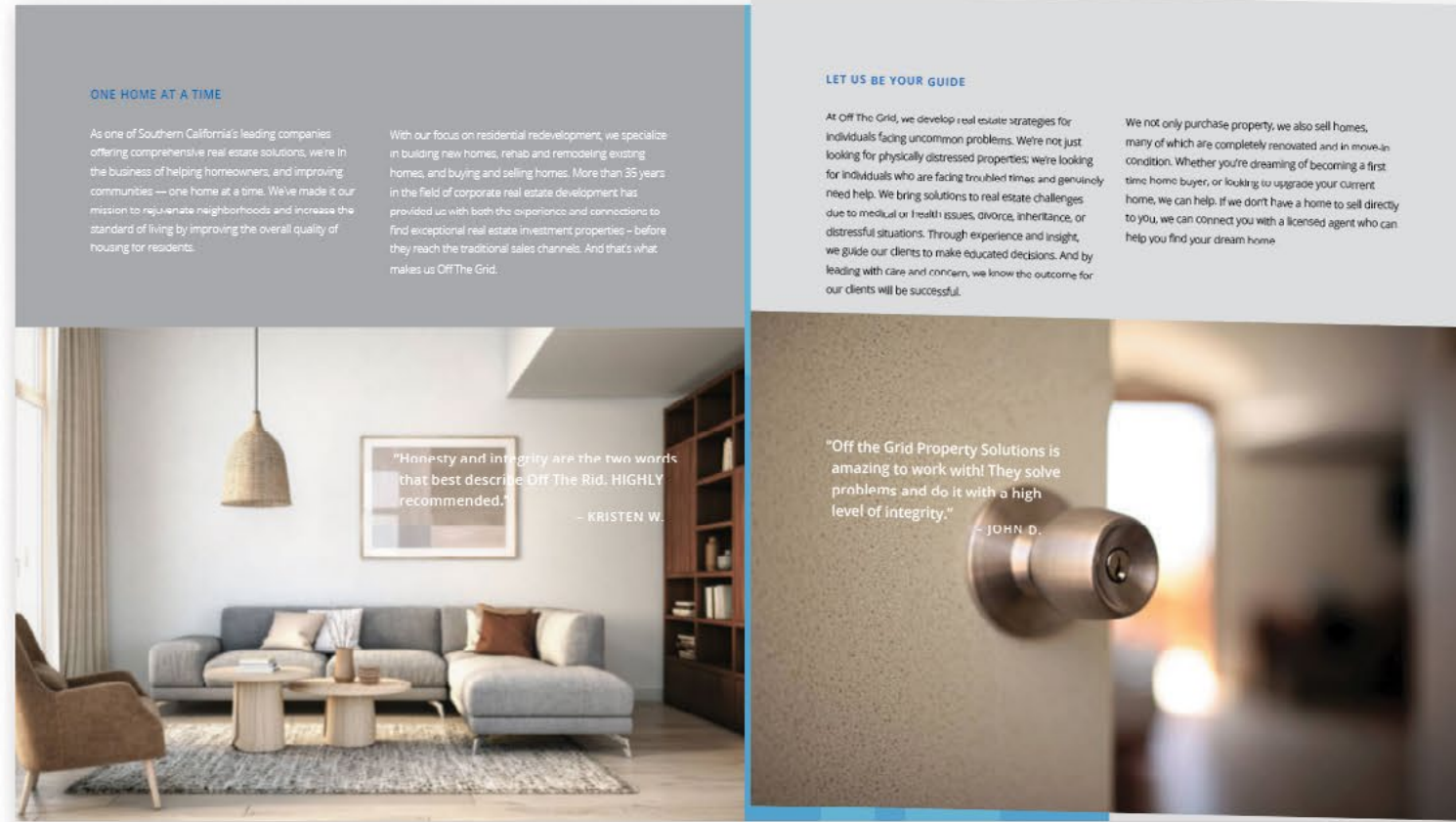
INSIDE FRONT COVER AND OVERLEAF