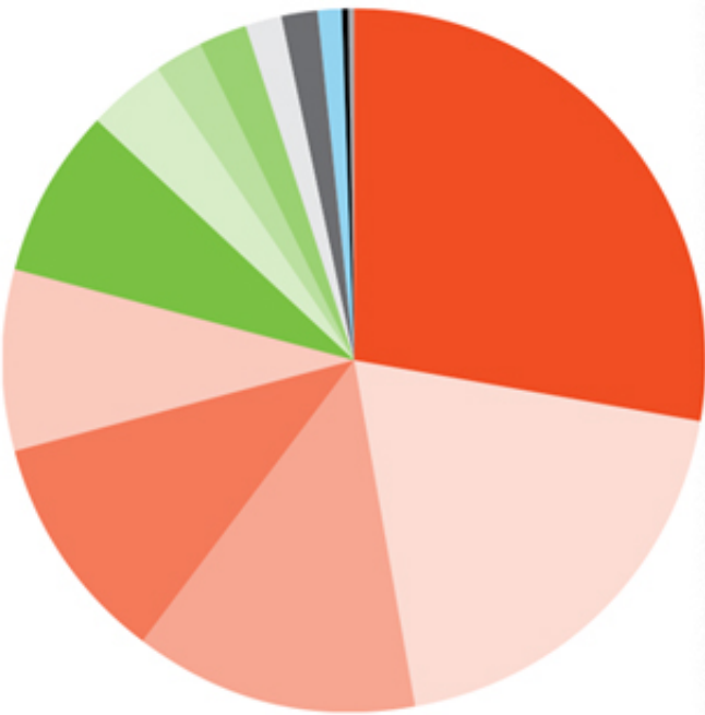
Places Ranked by Total Number of Loans

The number of PPP loans varied greatly by city or place. Since the number of businesses in that place, no direct relationship exists between a place and the number of PPP loans. While Indio is the most populous city in the Coachella Valley, it received the greatest number of PPP loans.