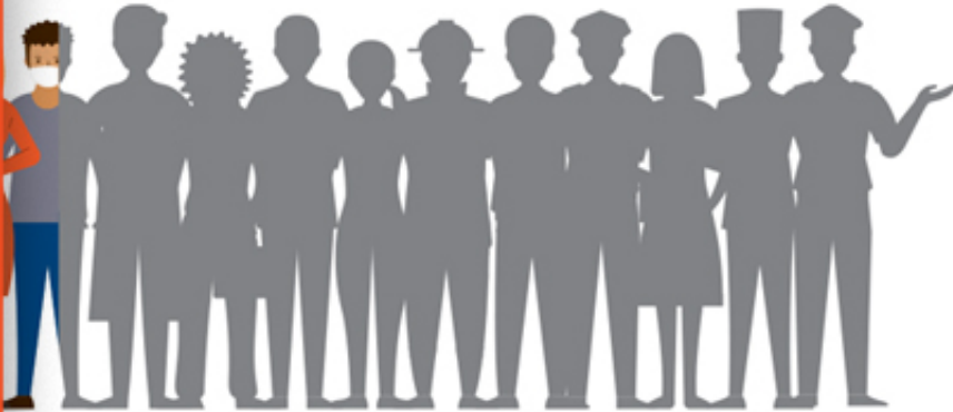
Places Ranked by Jobs as of December 2019